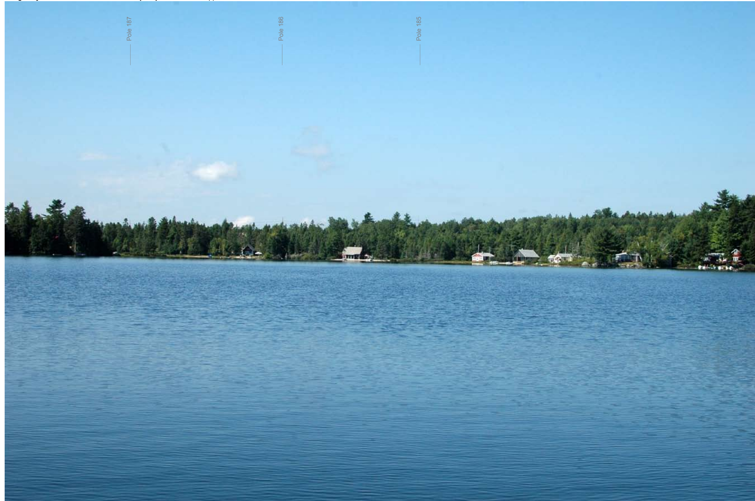
Photosimulation of Bangor Hydro Electric's 115 kV transmission line looking west southwest from viewpoint B on Georges Pond. The top portion of Poles 185, 186, and 187 will be visible 2,750' to 2,900' from this location. Viewer should hold this image, when printed at 11"x17", approximately 20" from eye to replicate actual view.