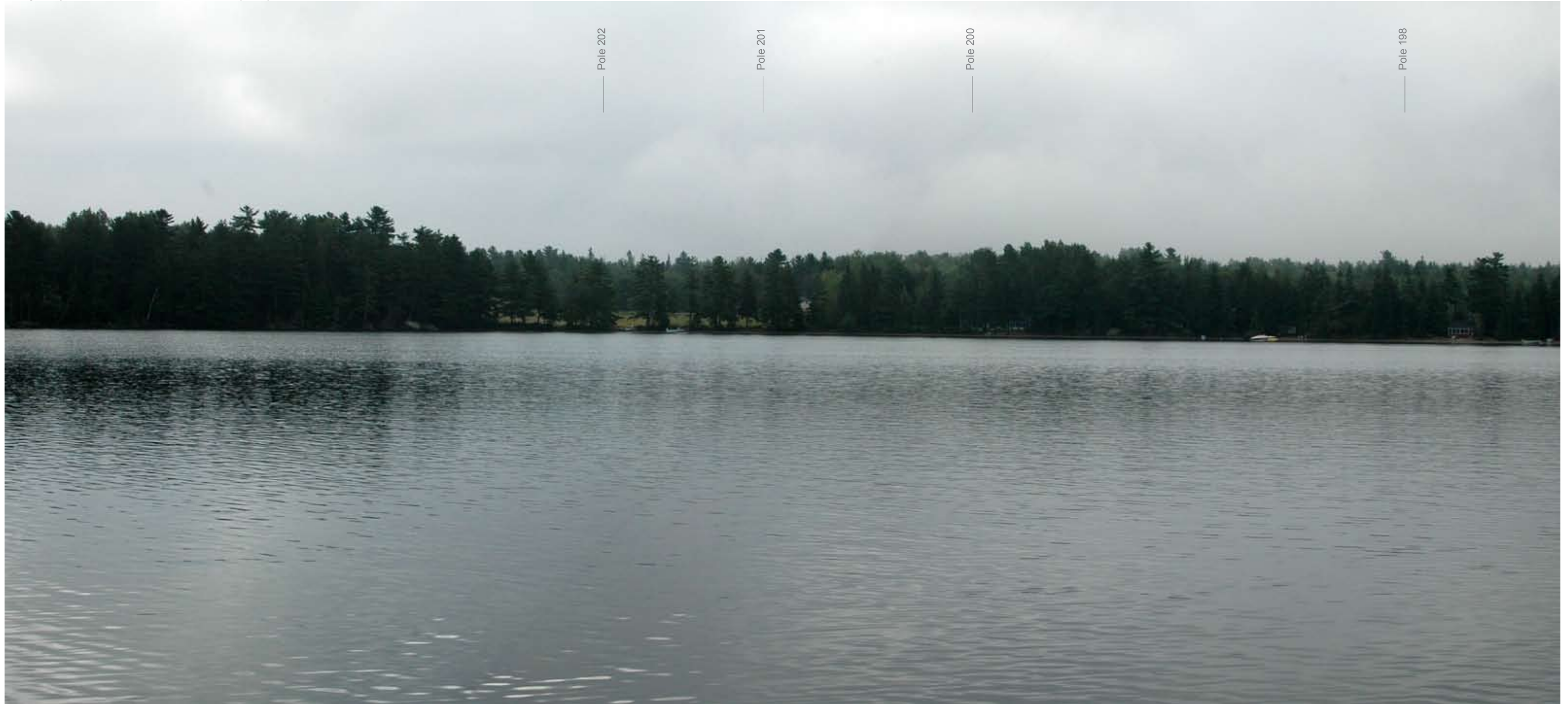
Photosimulation of Bangor Hydro Electric's 115 kV transmission line looking east southeast from viewpoint C on Georges Pond. The top portion of Poles 198, 200, 201, and 202 will be visible 2,250' to 2,400' from this location. Viewer should hold this image, when printed at 11"x17", approximately 18" from eye to replicate actual view.