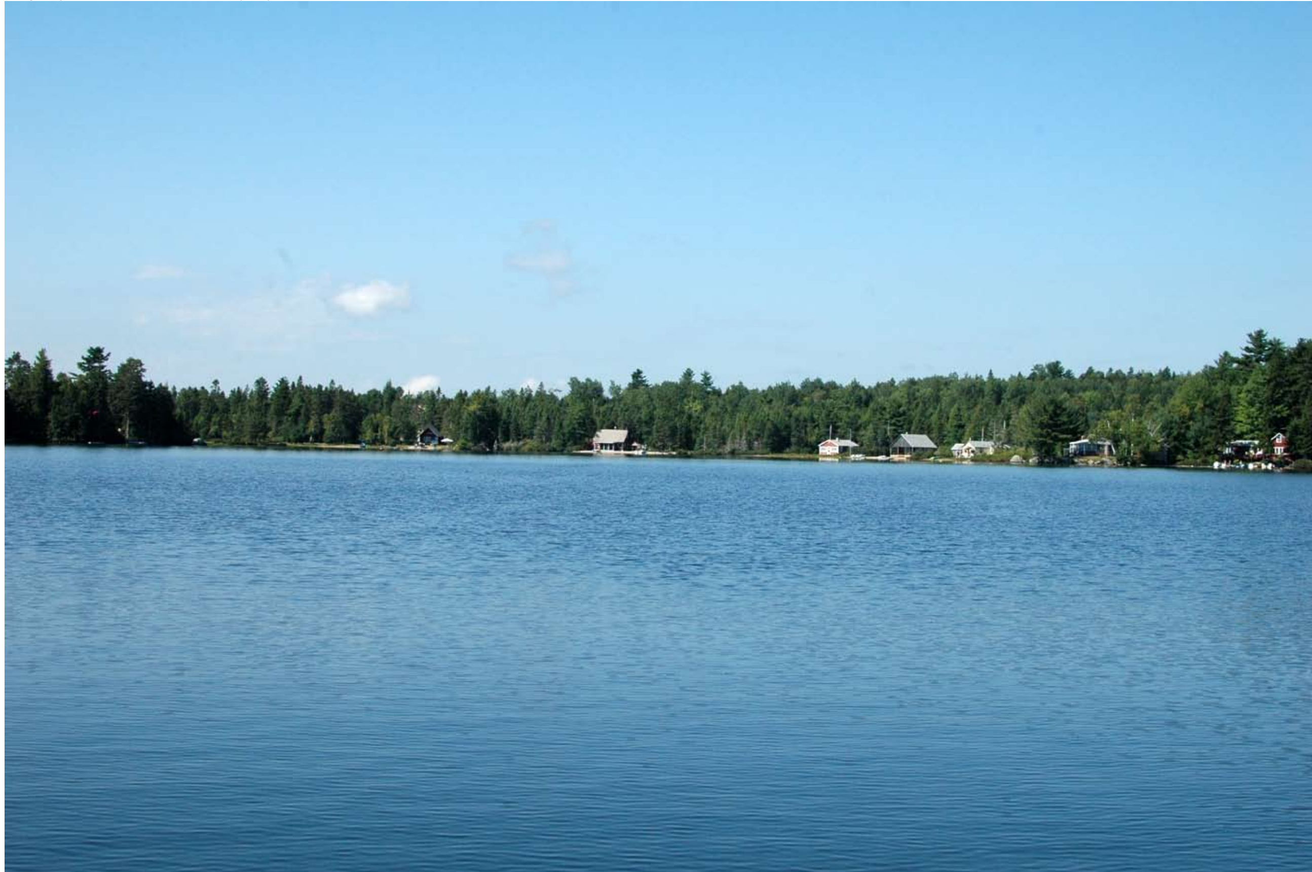
Existing view looking west southwest from viewpoint B on Georges Pond. Photograph taken at 10:12 AM on August 17, 2010. Viewer should hold this image, when printed at 11"x17", approximately 20" from eye to replicate actual view.