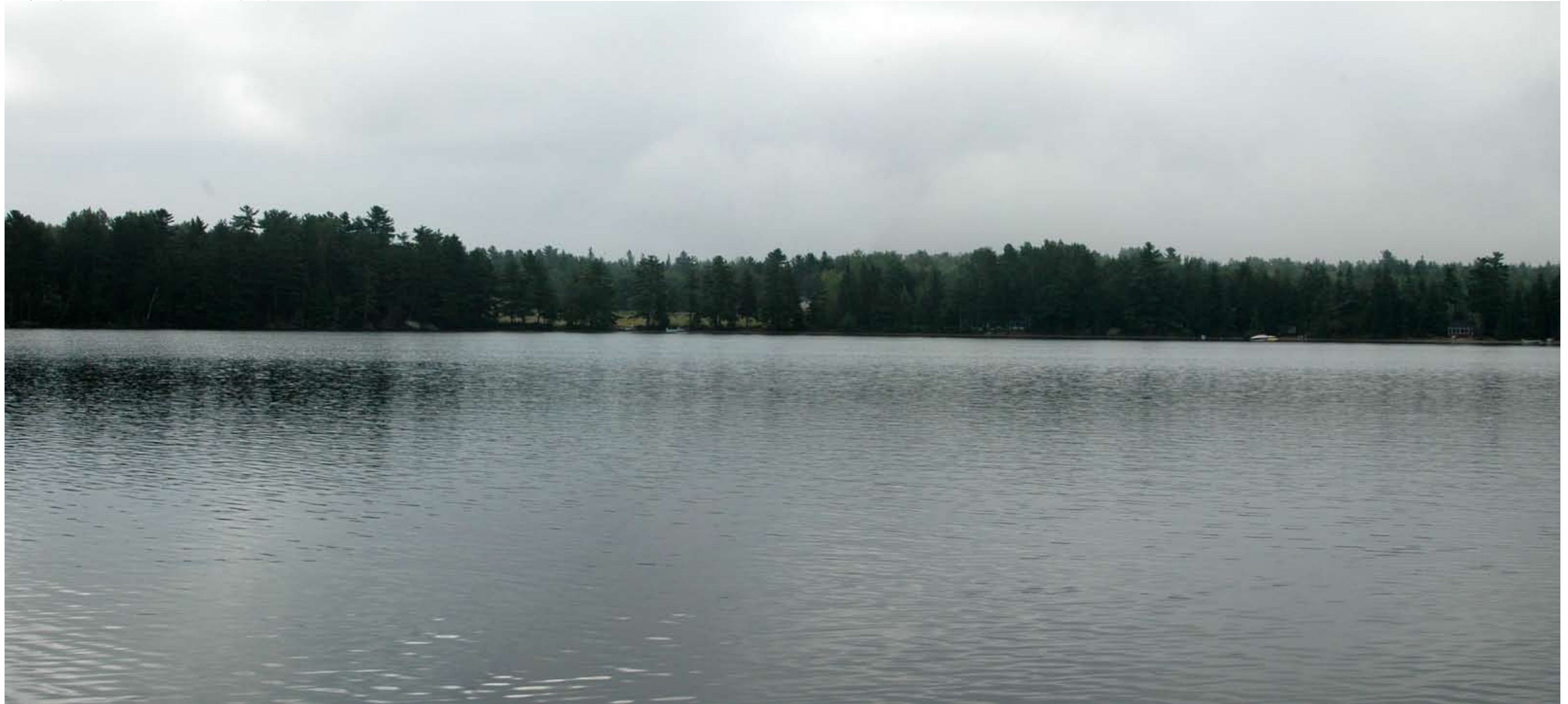
Existing view looking east southeast from viewpoint C on Georges Pond. Photograph taken at 7:36 AM on August 17, 2010. Morning fog had just burned off the pond. Viewer should hold this image, when printed at 11"x17", approximately 18" from eye to replicate actual view.