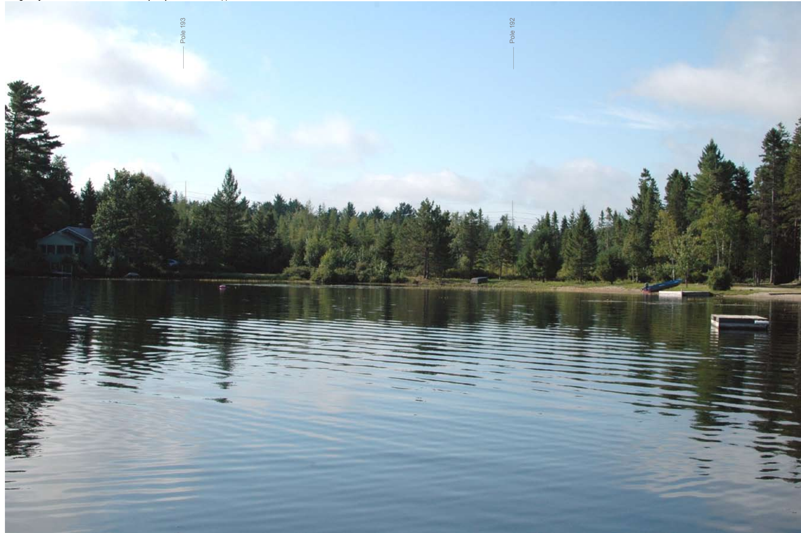
Photosimulation of Bangor Hydro Electric's 115 kV transmission line looking south southwest from viewpoint A on Georges Pond. The top portion of Poles 192 and 193 will be visible 1,100' to 1,200' from this location. Viewer should hold this image, when printed at 11"x17", approximately 20" from eye to replicate actual view.