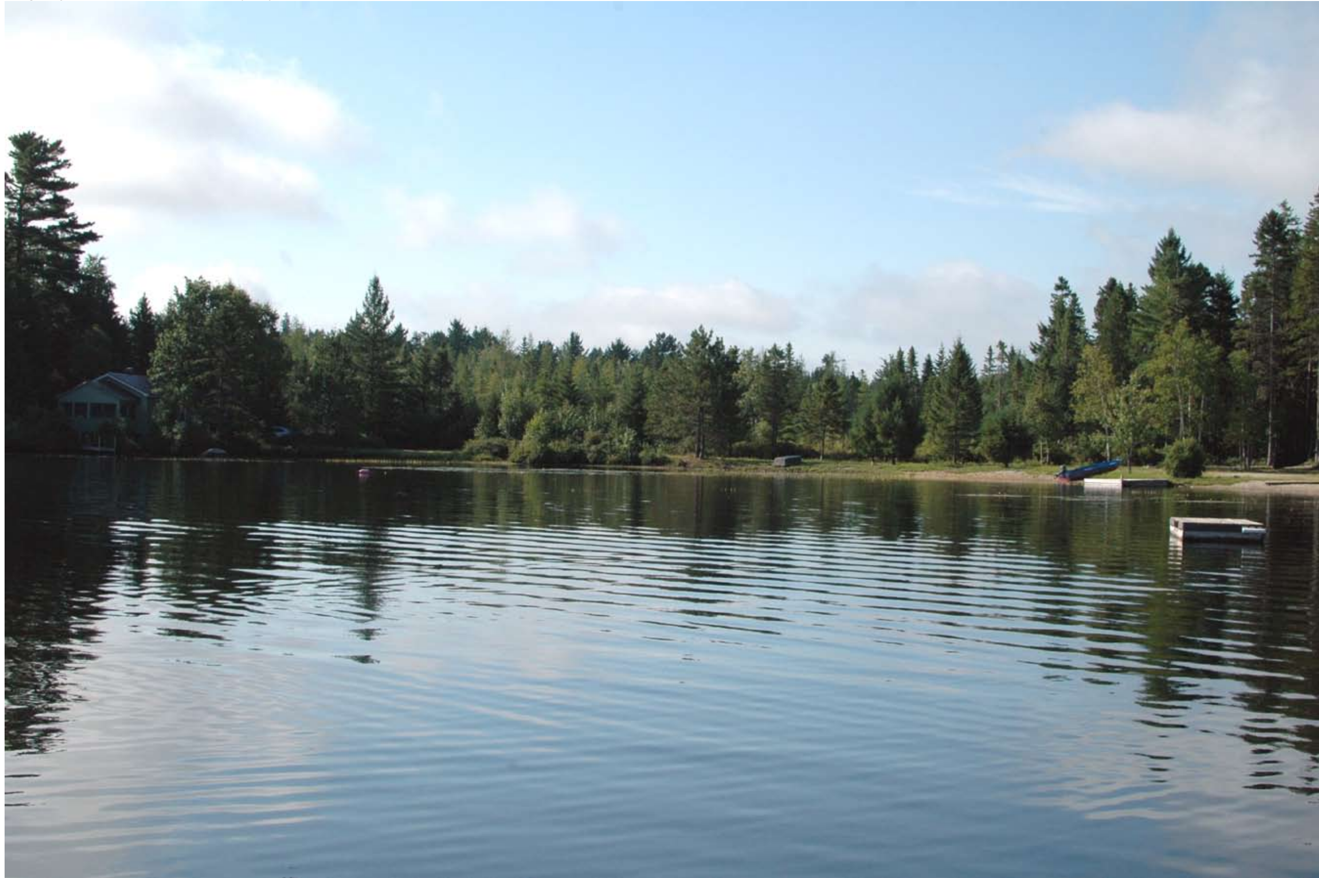
Existing view looking south southwest from viewpoint A on Georges Pond. Photograph taken at 9:04 AM on August 17, 2010. Viewer should hold this image, when printed at 11"x17", approximately 20" from eye to replicate actual view.